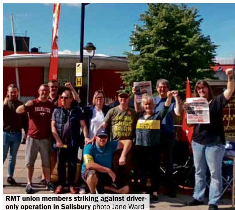
RMT union members striking against driver-only operation in Salisbury