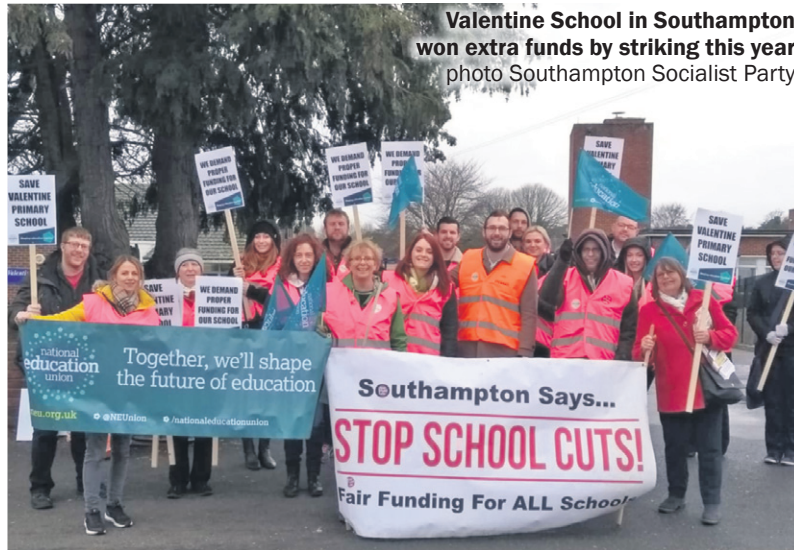
Valentine School in Southampton won extra funds by striking this year