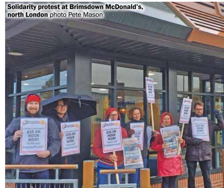
Solidarity protest at Brimsdown McDonald's, north London