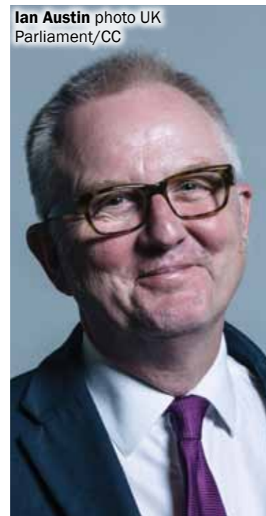
Ian Austin