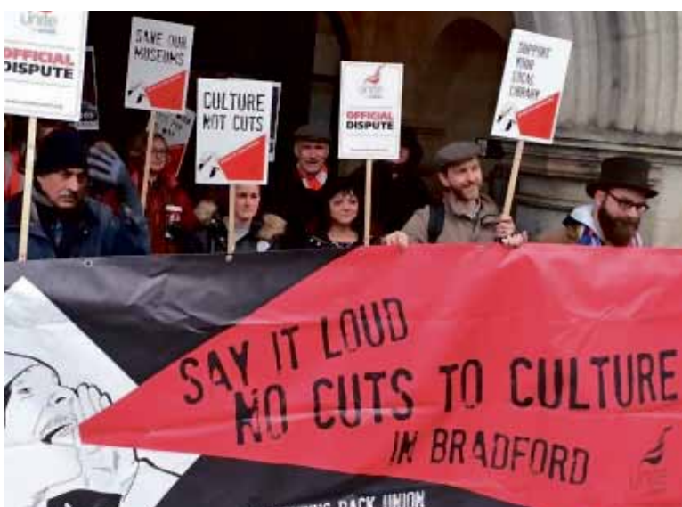
Libraries and museum workers in Bradford are fighting spending cuts

socialiststudents.org.uk socialist students