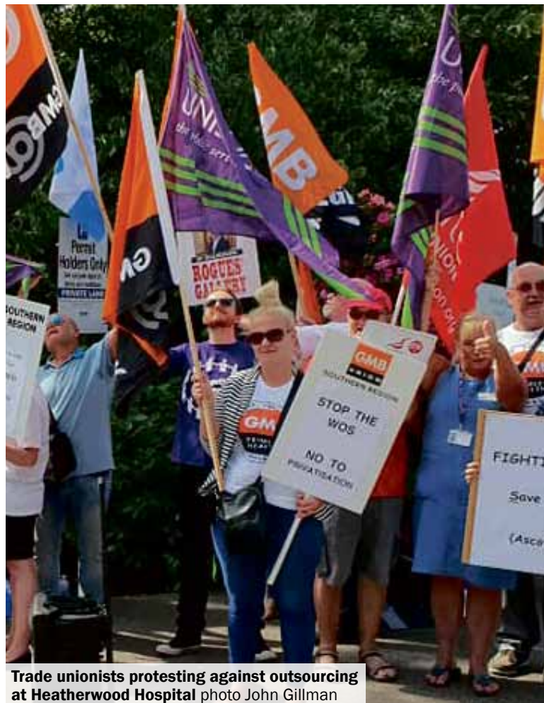
Trade unionists protesting against outsourcing at Heatherwood Hospital