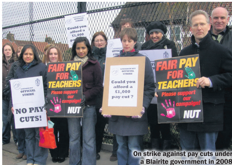
On strike against pay cuts under a Blairite government in 2008

Whatever the result of the general election, education unions need to prepare for decisive action to defend education