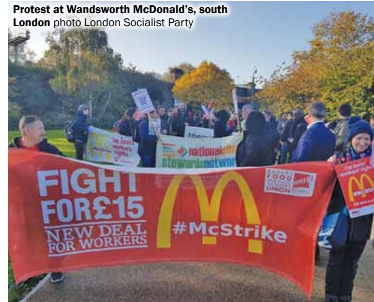
Protest at Wandsworth McDonald's, south London

The Bakers Union said that these brave workers were standing up for low paid and zero-hour contract workers across the country. Labour shadow chancellor John McDonnell spoke and pledged support for the strikers £15 claim.