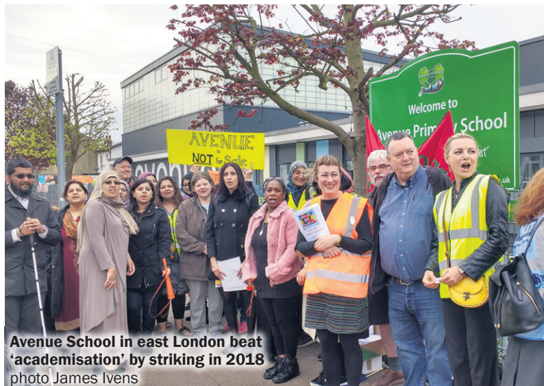
Avenue School in east London beat 'academisation' by striking in 2018

These are policies which every parent, school student and member of staff will be hoping - and expecting - a Labour government will carry out.