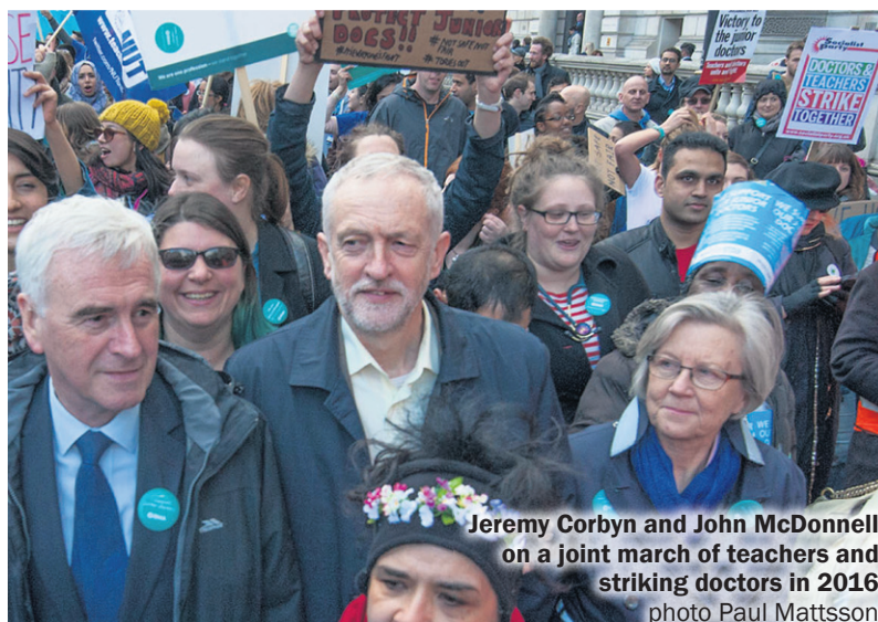
Jeremy Corbyn and John McDonnell on a joint march of teachers and striking doctors in 2016