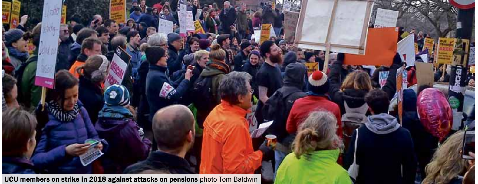
UCU members on strike in 2018 against attacks on pensions

The eight days of consecutive action reflects increasing confidence