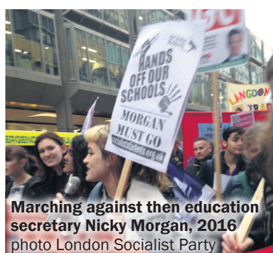
Marching against then education secretary Nicky Morgan, 2016