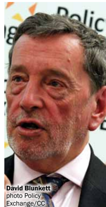
David Blunkett

motivated anti-semitic incidents come from far-right sources."