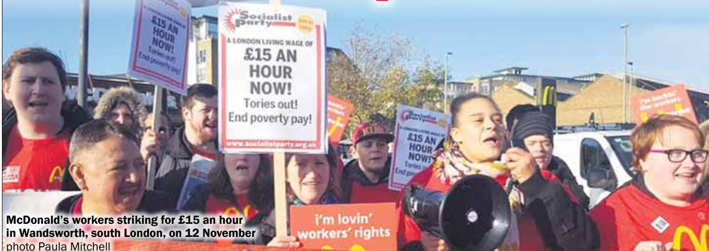
McDonald's workers striking for £15 an hour in Wandsworth, south London, on 12 November