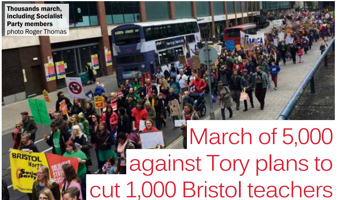
Thousands march, including Socialist Party members

March of 5,000 against Tory plans to cut 1,000 Bristol teachers