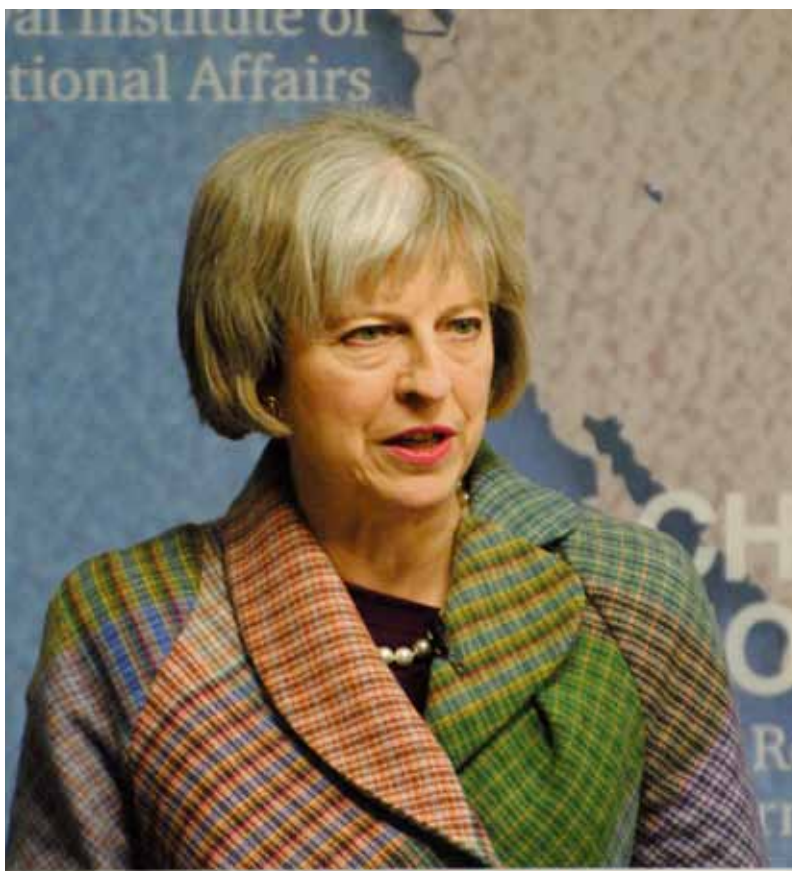
CHATHAM HOUSE the Royal Institute of