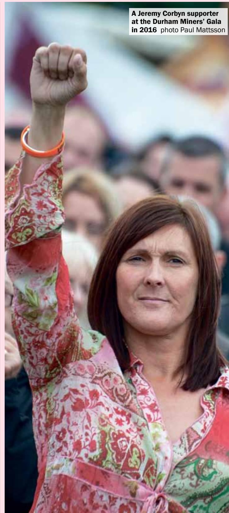
A Jeremy Corbyn supporter at the Durham Miners' Gala in 2016

We reserve the right to shorten and edit letters. Don't forget to give your name, address and phone number. Confidentiality will be respected if requested.