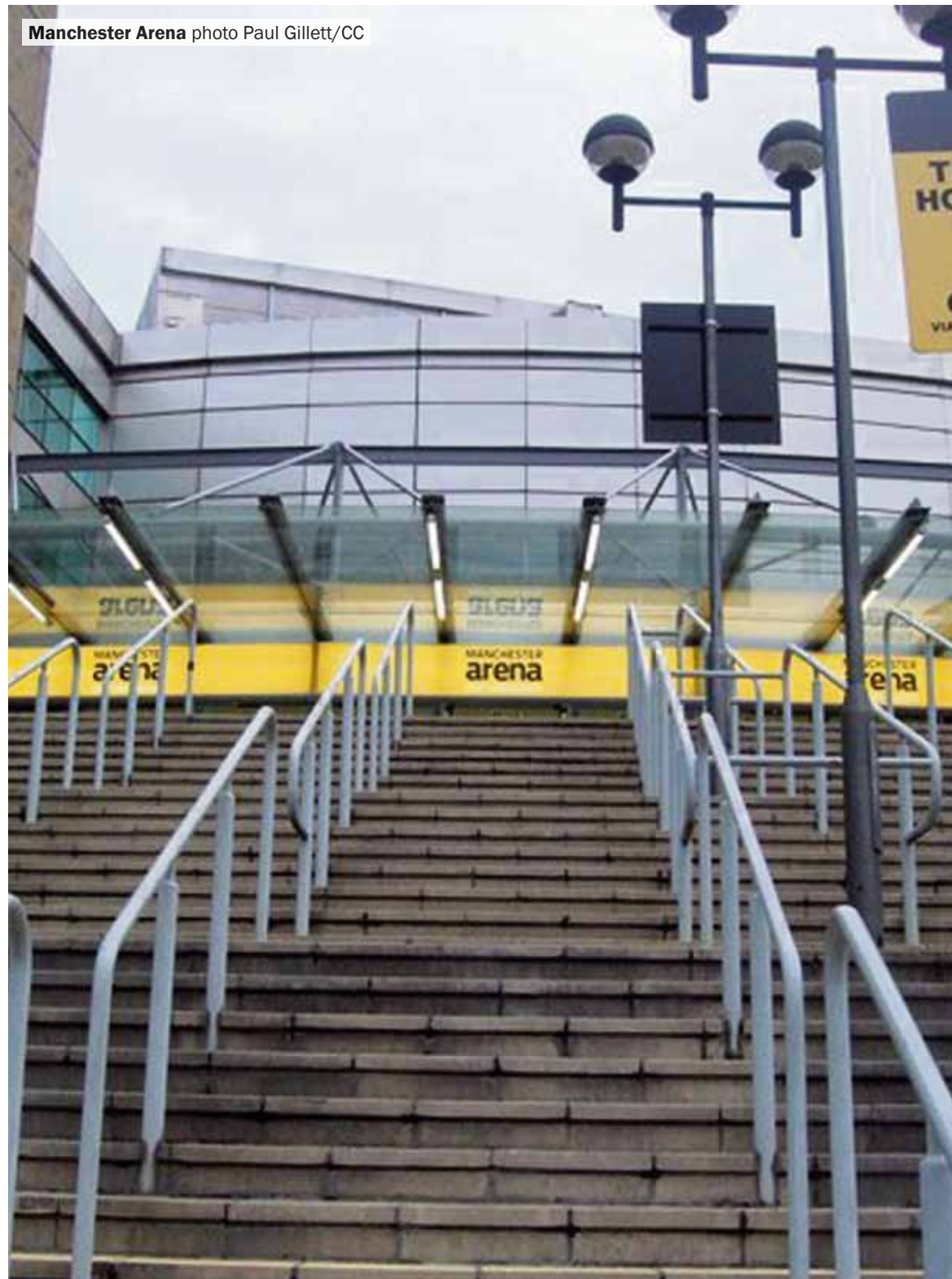
Manchester Arena

The imperialist powers, on their part, are intervening for their own prestige and influence and in the