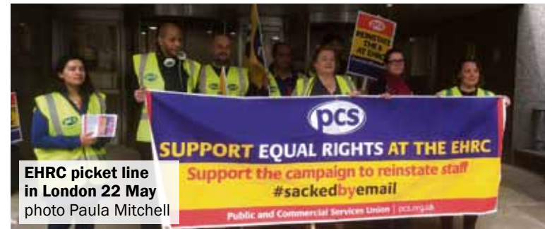
EHRC picket line in London 22 May

Strikers commented that it is good that defending the EHRC is in Jeremy Corbyn's manifesto and hope that if he wins they will stop this attack. But they are prepared to fight on in any case.