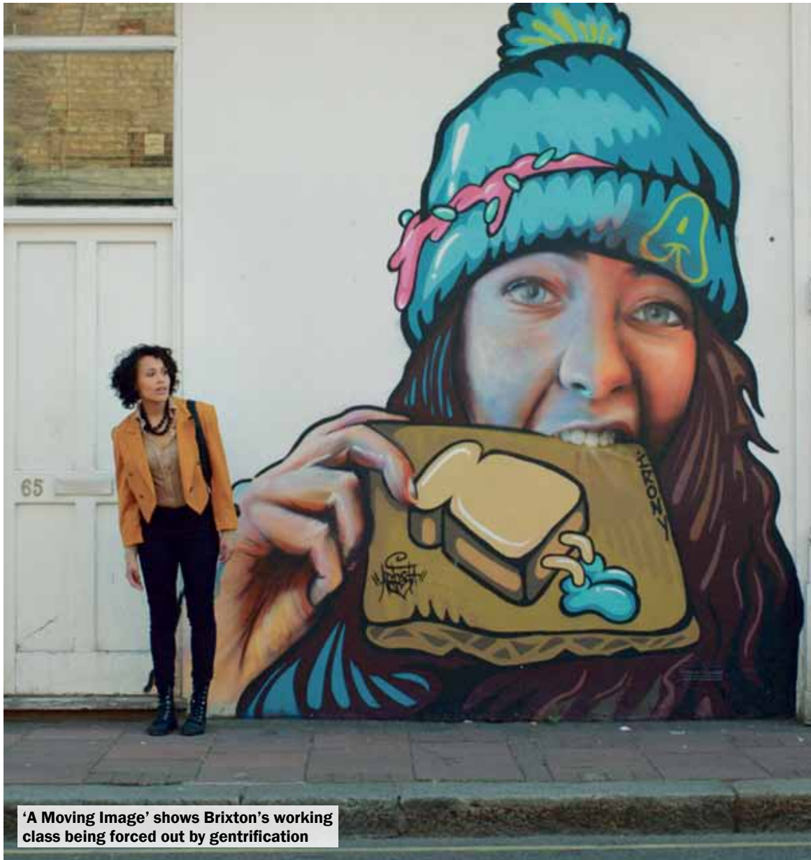
'A Moving Image' shows Brixton's working class being forced out by gentrification